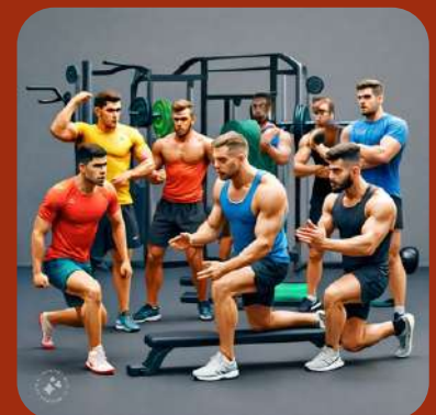
Training & Workshop