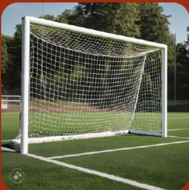
Goalpost & Nets